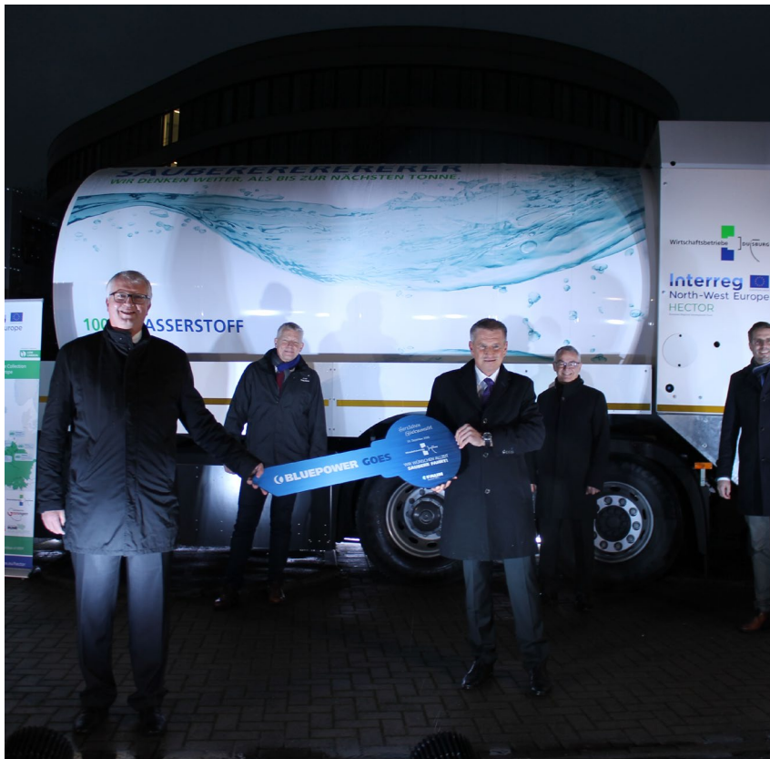
WBD launch 2 nd Dec 20